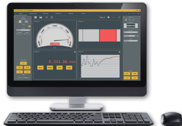
Free Sylcom LITE version on www.sylvac.ch

Additional versions (modules) will be available in the coming months. For features and functionality, refer to the table at the end of the chapter.