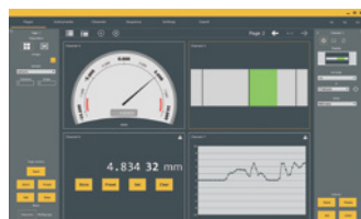
Multi-channel display with colour-coded tolerances