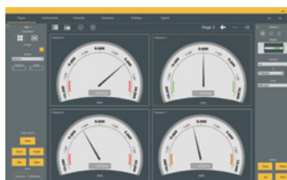
Multi-channel analogue display