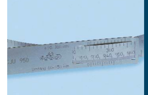
Vernier of Circometer CJU